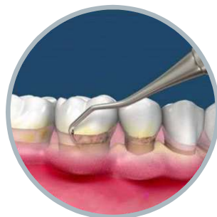
No pain Supra and Subgingival Scaling

NO-PAIN ultrasonic piezo treatment It combines scaling, periodontal and endodontic in one device. 5 stainless tips and 10 titanium alloy perio treatment tips attached, they can meet the most needs of supragingival and subgingival scaling operations.