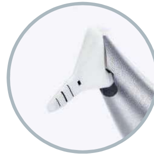
Subgingival Air Polishing

RESIDUAL POCKETS / DEEP TRANS MUCOSAL PORTION Preserves integrity of cementum, dentin and implant surfaces during treatment.