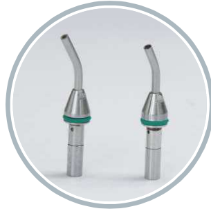
Supragingival Air Polishing

Air polishing with sand blasting Effectively remove the dental plaque in Supragingival and subgingival with sand blasting which driven by high pressure air to prevent the oral disease.