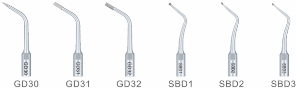
GD32 For the preparation of distal cavity